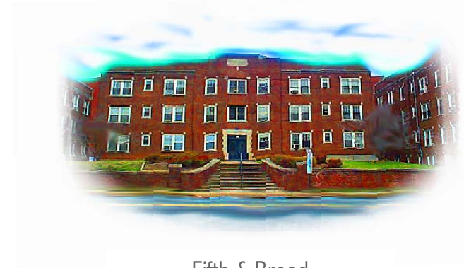
Fifth & Broad Winston-Salem

Gray Court Apartments, circa 1928, are located in the West End Historic District. This central local offers easy access to the downtown businesses, Avenue of the Arts, and I-40. The apartment complex features numerous amenities including off-street parking, Trolley service, and on-site laundry facility.